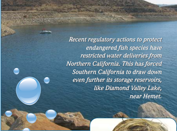
Recent regulatory actions to protect endangered fish species have restricted water deliveries from Northern California. This has forced Southern California to draw down even further its storage reservoirs, like Diamond Valley Lake, near Hemet.

If present, elevated levels of lead can cause serious health problems, especially for pregnant women and young children. Lead in drinking water is primarily from materials and components associated with service lines and home plumbing. El Toro Water District is responsible for providing high quality drinking water, but cannot control the variety of materials used in plumbing components. When your water has been sitting for several hours, you can minimize the potential for lead exposure by flushing your tap for 30 seconds to 2 minutes before using water for drinking or cooking. If you are concerned about lead in your water, you may wish to have your water tested. Information on lead in drinking water, testing methods, and steps you can take to minimize exposure is available from the Safe Drinking Water Hotline or at: www.epa.gov/safewater/lead .