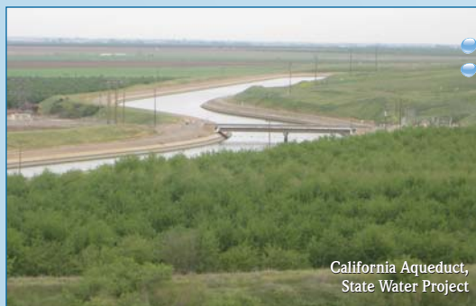
California Aqueduct, State Water Project

However, chlorine can react with naturally-occurring materials in the water to form unintended chemical byproducts, called disinfection byproducts (DBPs), which may pose health risks. A major challenge is how to balance the risks from microbial pathogens and DBPs. It is important to provide protection from these microbial pathogens while simultaneously ensuring