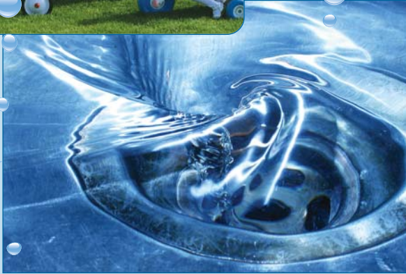
Water conservation doesn't have to inconvenience our lives to be effective. Simple changes in how we do our daily tasks can have a tremendous impact on our water usage. A little effort can save a lot of water.

There's a wealth of information on the internet about Drinking Water Quality and water issues in general. Some good sites — both local and national — to begin your own research are: